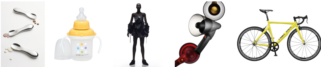
(From left to right) 15.0% Ice Cream Spoon, teteo Mugseries(Mugbaby),132 5. ISSEY MIYAKE "No.1 Dress", Splash-proof Hand Grip Type Megaphones, HELMZ SSSD